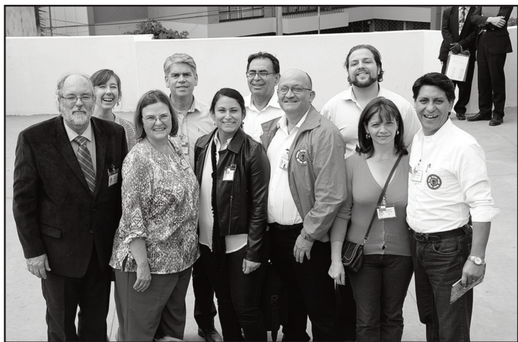
Representatives from Chile