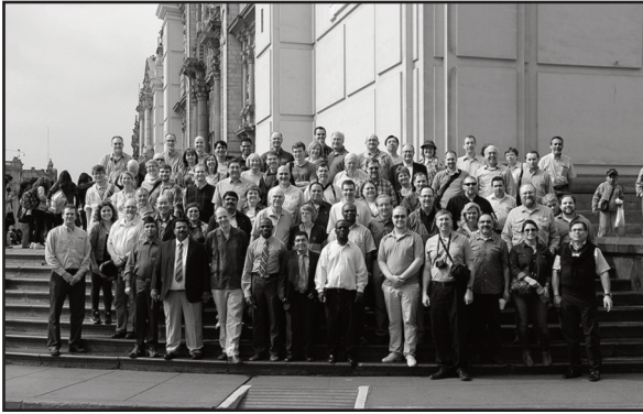
Touring in Lima