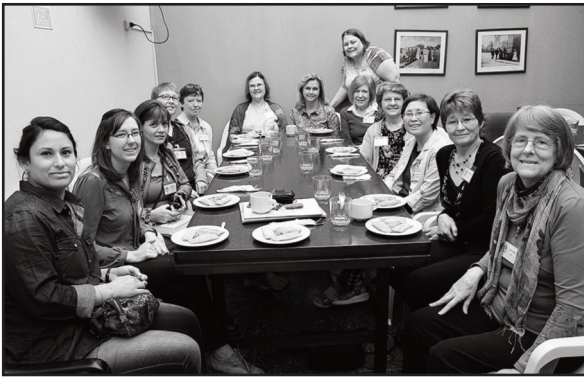
Women at the convention