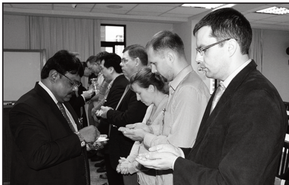
Closing Communion Service