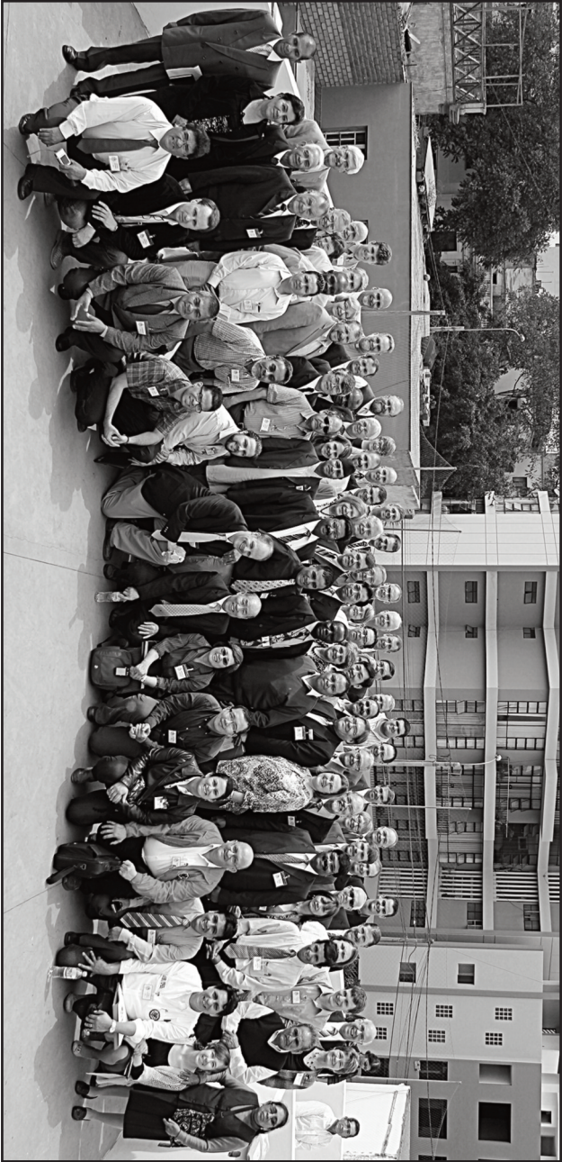
Group photo on the roof of the seminary building