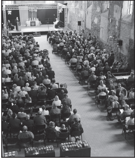
The closing service