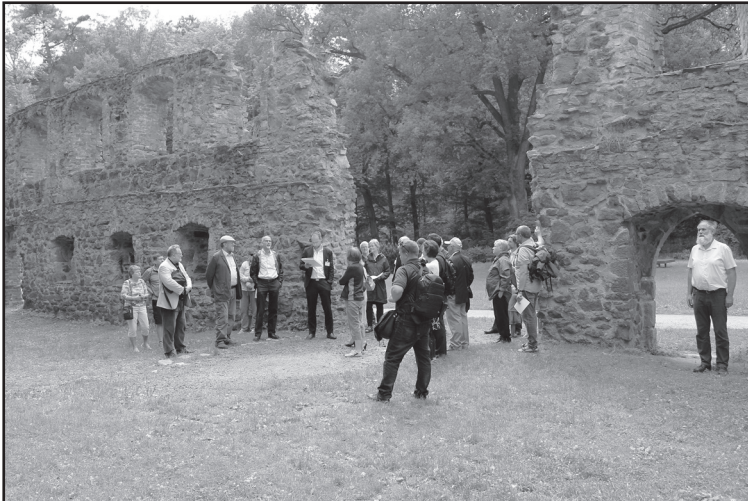
Delegates toured the ruins of Nimbschen cloister, where Katie Luther was a nun