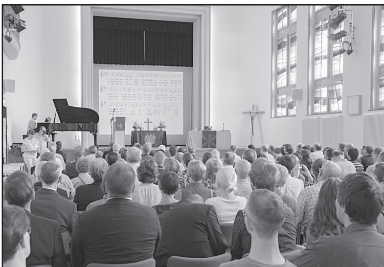
Convention sessions were held in the aula of the St. Augustin academy building