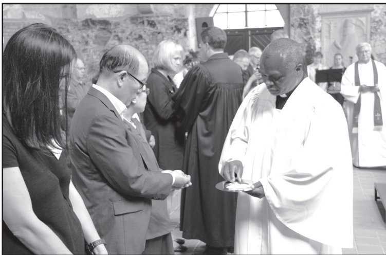
Delegates and guests communing at the closing service