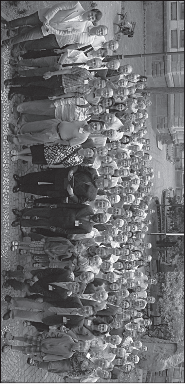
CELC Convention Group Photo in the Courtyard of the "Gymnasium St. Augustin" in Grimma, Germany