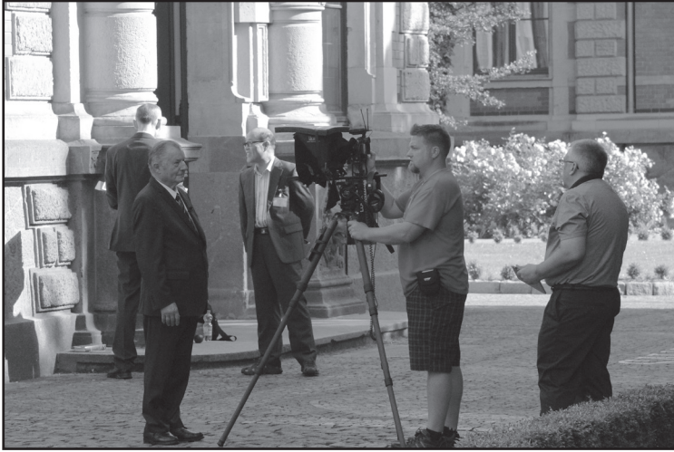
Filming the reading of the 95 Theses