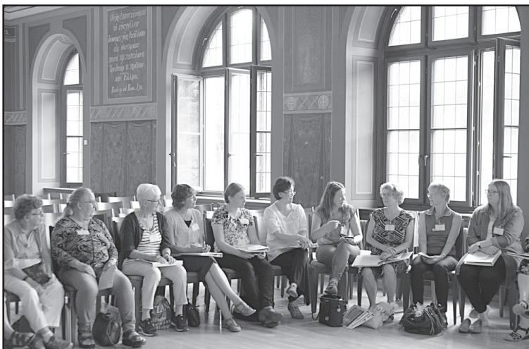
Women attending the convention also met for Bible study and discussion.