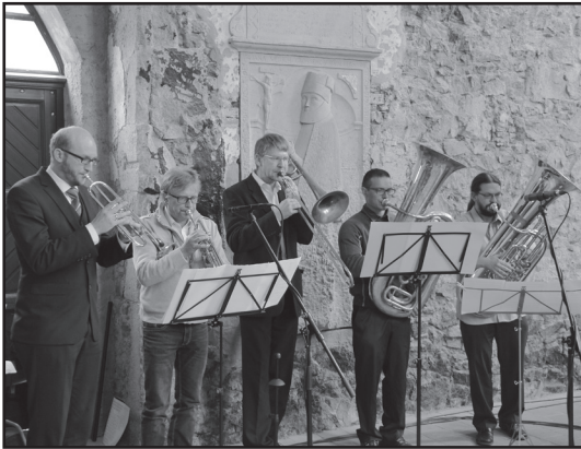
Those attending the Closing Service enjoyed brass accompaniment and an ELFK choir.