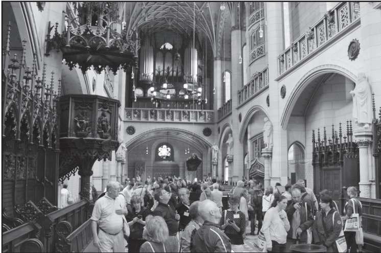
Delegates tour the Castle Church in Wittenberg, where Luther nailed his 95 Theses.