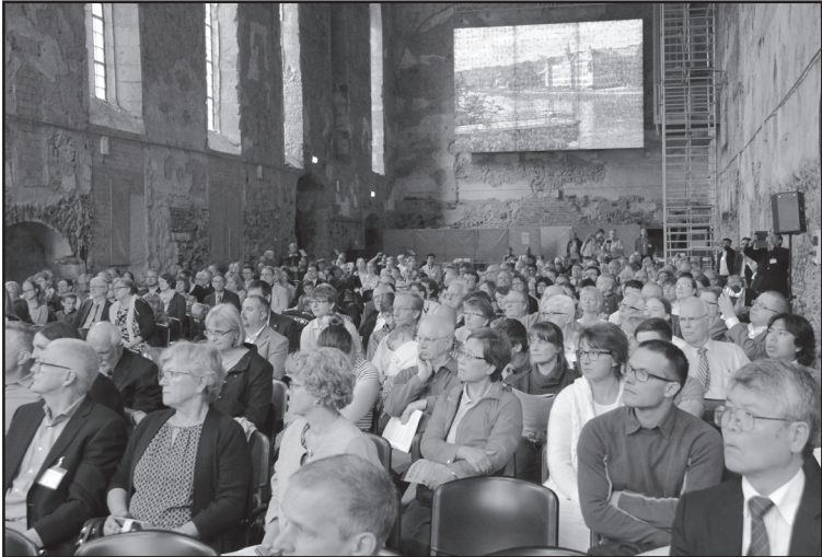
The closing service