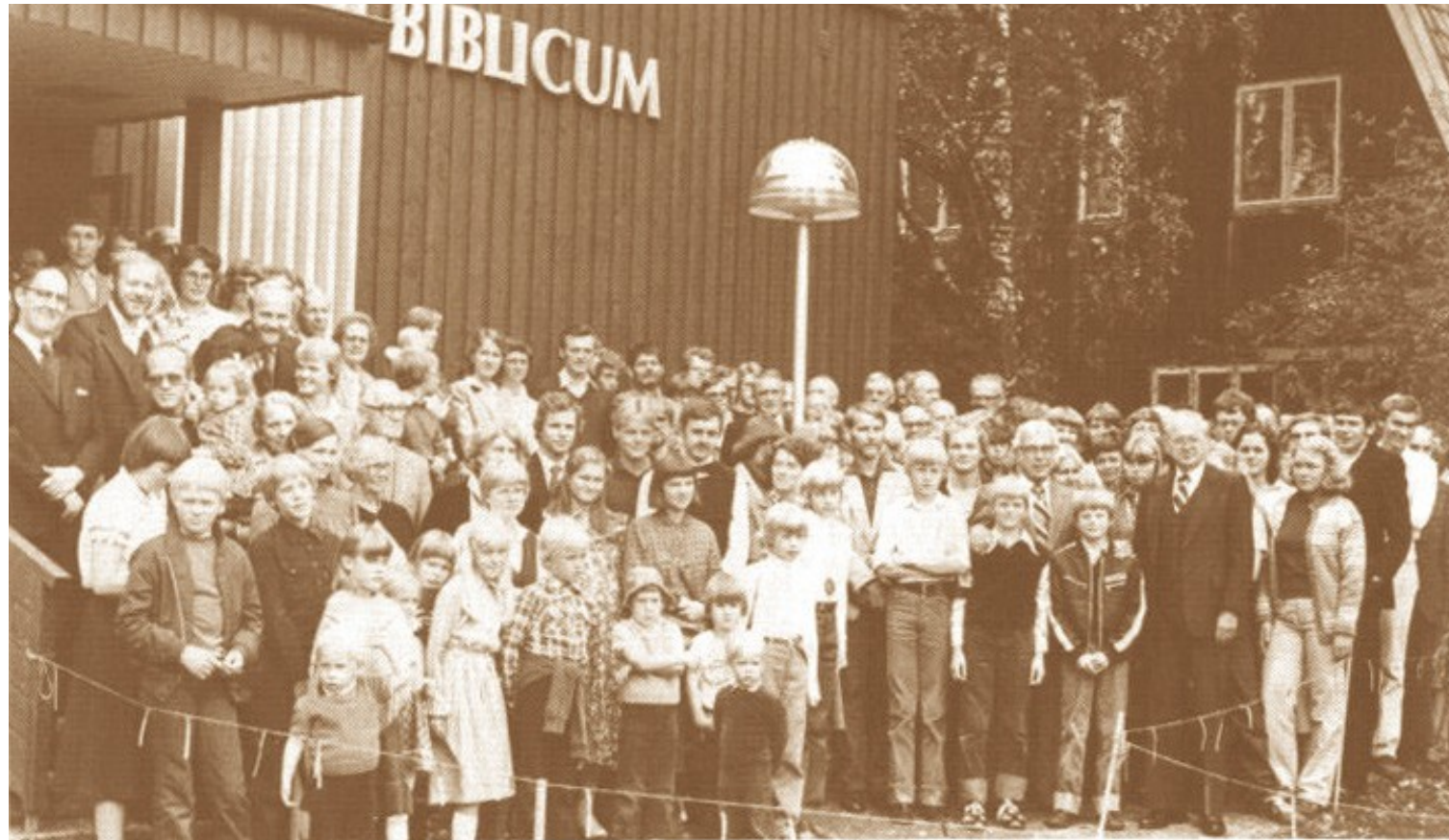
Dedication of Biblicums annex building in Uppsala 1980