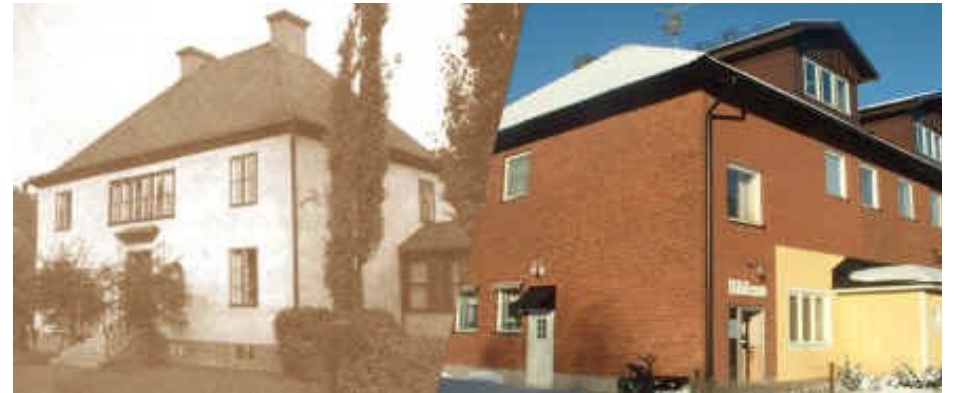
To the left Biblicum's first building in Uppsala, to the right the present building in Ljungby