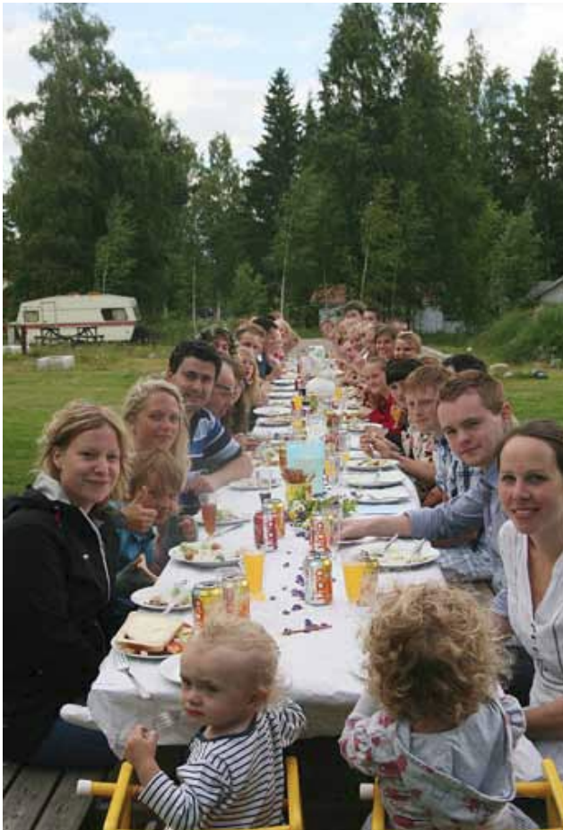
Midsummer camp, with herring and strawberries