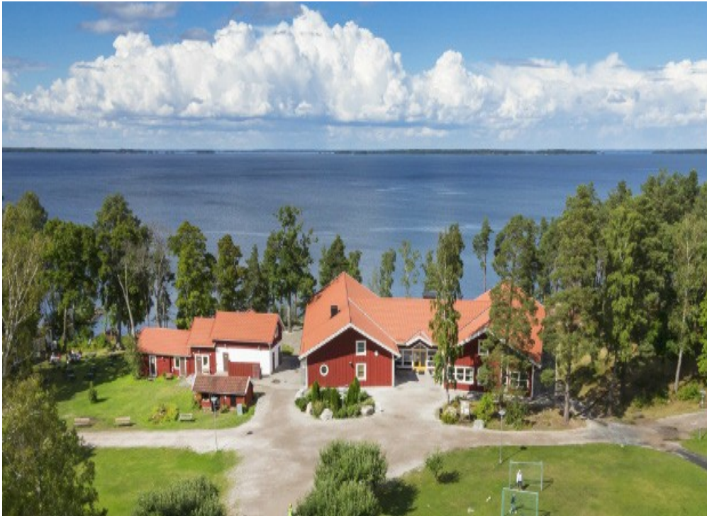
Hjälmgården, rented for our summer camps