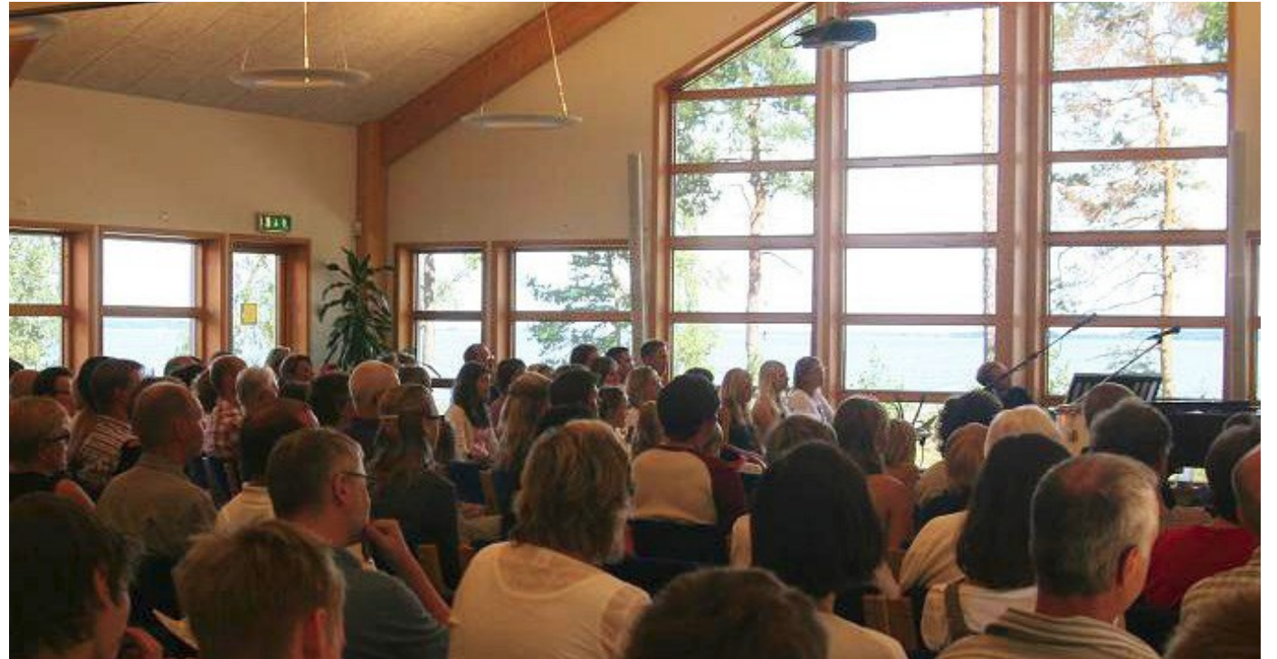
The annual church conventions/summer camps usually gather about 60% of the members and serve as an opportunity for Biblical lectures and instruction, aimed for members of all ages.